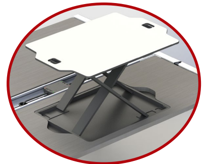
Adjusts from 29" to 44" Holds up to 22 pounds