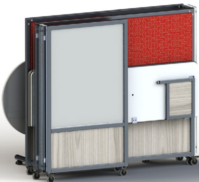
Rendezvous mobile meeting room folded for easy storage

For more information about our products or to schedule a demo visit www.swiftspaceinc.com