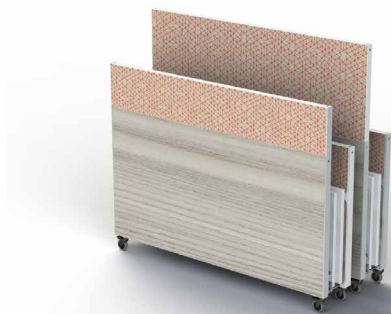
Two Shift stations fully collapsed for easy storage

For more information about our products or to schedule a demo visit www.swiftspaceinc.com