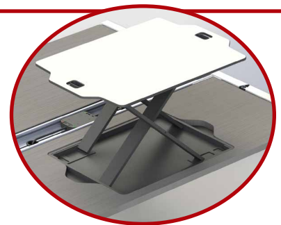
Adjusts from 29" to 44" Holds up to 22 pounds