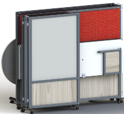
Rendezvous mobile meeting room folded for easy storage

For more information about our products or to schedule a demo visit www.swiftspaceinc.com